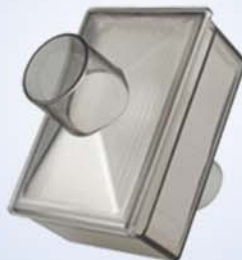
Intake Bacteria Filter UNIT- Millennium PART # SPF-IBF QTY - each