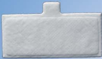
Ultra Fine Filter UNIT- Remstar Pro, Pro2, Plus & Auto PART # SPF-1005945 QTY - 6 pack