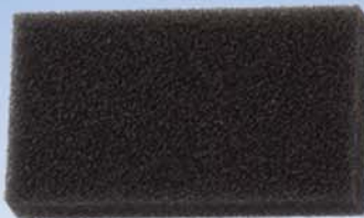
Foam Pollen Filter UNIT- M Series PART # SPF-1029330 QTY - 2 pack