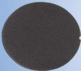
Foam Pollen Filter UNIT- Remstar Series PART # SPF-362521 QTY - 6 pack