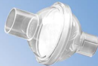
Bacteria Filter UNIT- Compatible with most CPAP devices PART # SPF-CPF QTY - each