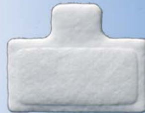
Ultra Fine Filter UNIT- M Series PART # SPF-1029331 QTY - 6 pack