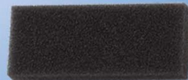
Foam Pollen Filter UNIT- Remstar Pro, Pro2, Plus & Auto PART # SPF-1005964 QTY - 2 pack